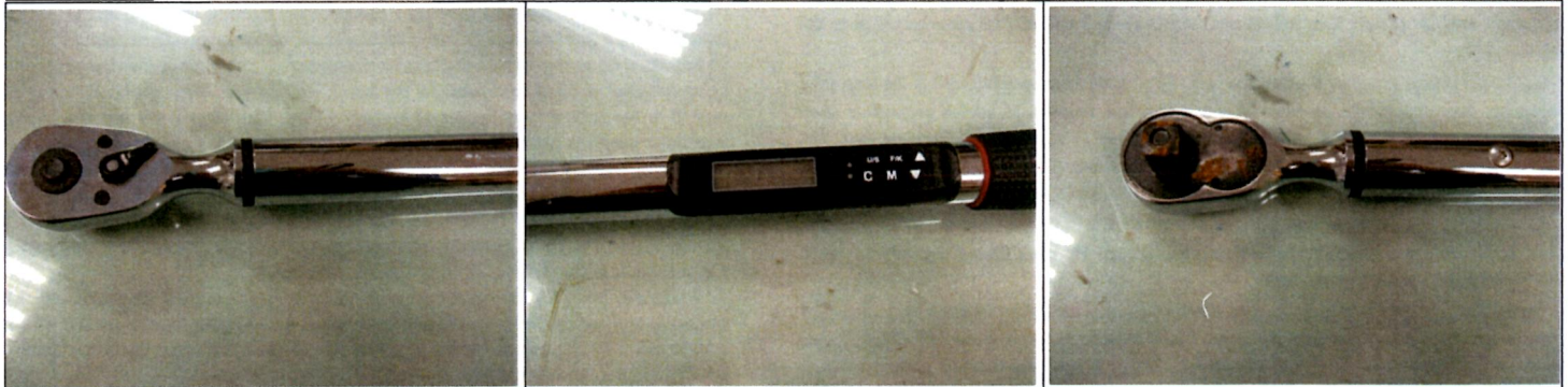
After test (Digital Torque Wrench)